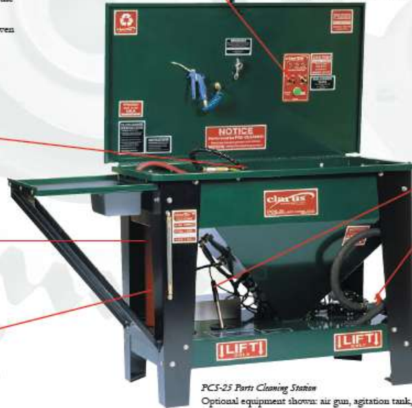
PCS-25 Parts Cleaning Station Optional equipment shown: air gun, agitation tank, pre-clean shelf.

Two soldiers can work side by side to clean and strip their weapons. This configuration includes a stainless soaking tray for weapon barrels and two ergonomically shaped solvent brushes.