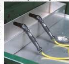
WCS-25 Weapons Cleaning Station

Two soldiers can work side by side to clean and strip their weapons. This configuration includes a stainless soaking tray for weapon barrels and two ergonomically shaped solvent brushes.