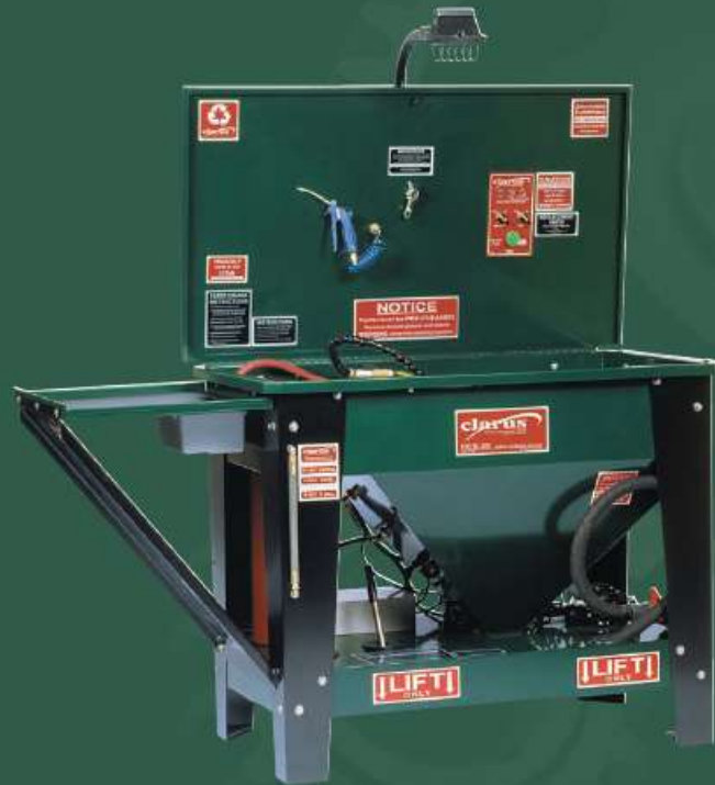
PCS-25 Parts Cleaning Station

Clean parts and weapons faster and easier—even as you save money and reduce waste.